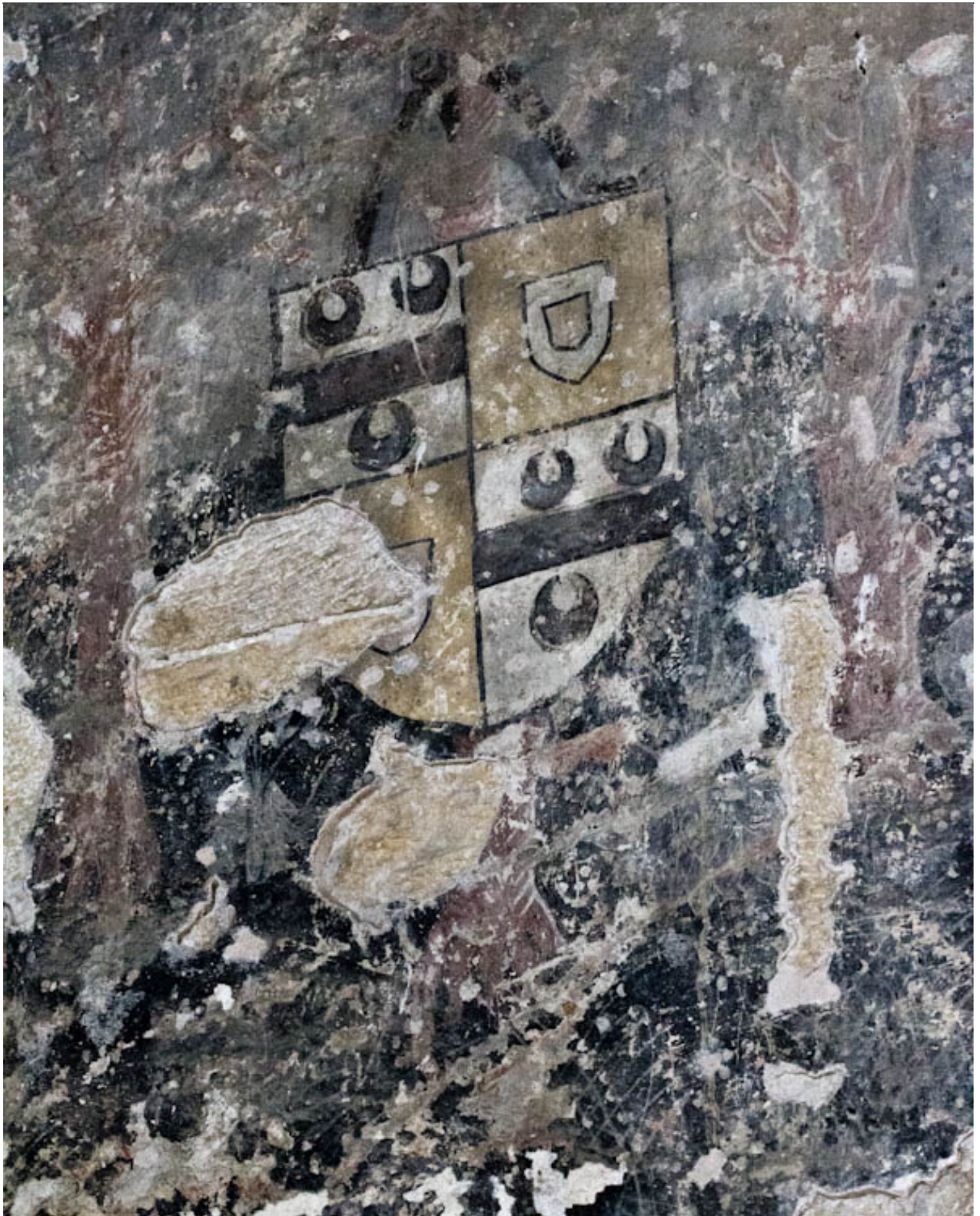
Original painted plaster in the great hall of the medieval tower