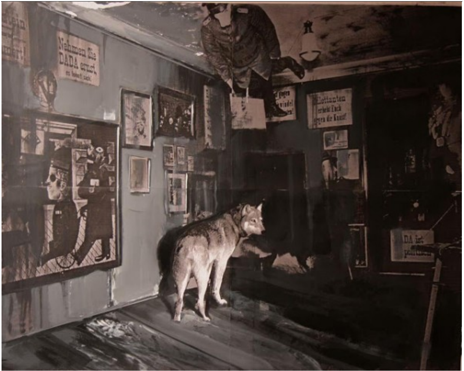
Adrian Ghenie, Dada is Dead - Ceau?escu's Romania through reworked media traces .