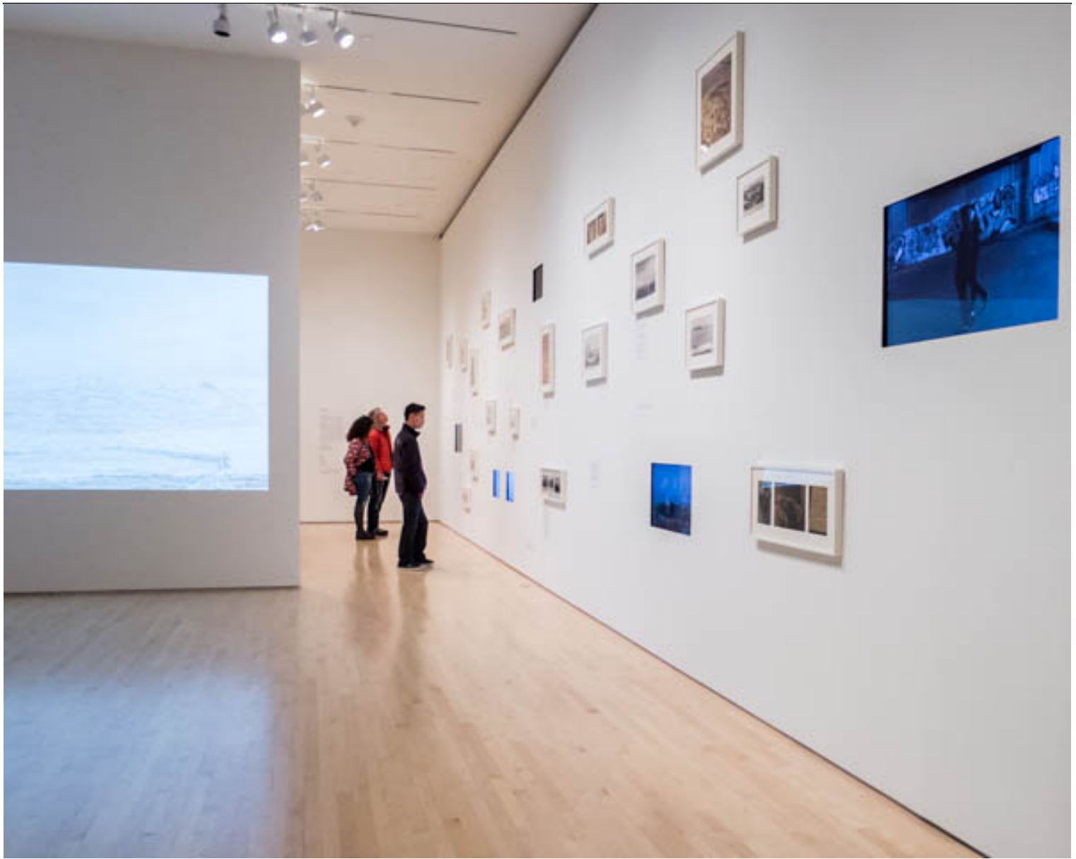
Lamia Joreige, Beirut, Autopsy of a City, 1200 BC - 2010 - an archaeological timeline of the city.