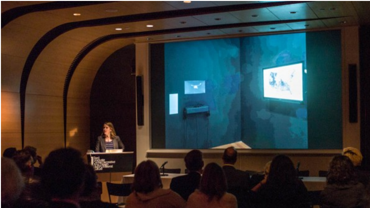
Paola Antonelli at Bard Graduate Center today – 8 November 2013

The merging of object, event, and site can make of the museum (without walls) – gesamptkunstwerk – a total-work-of-art [Link]